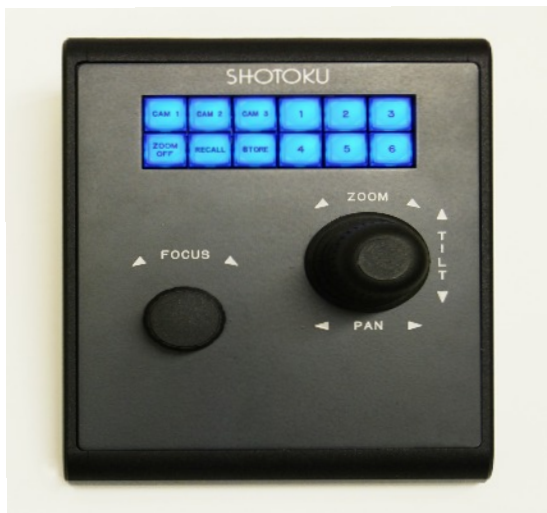
TR-HP Hot Panel