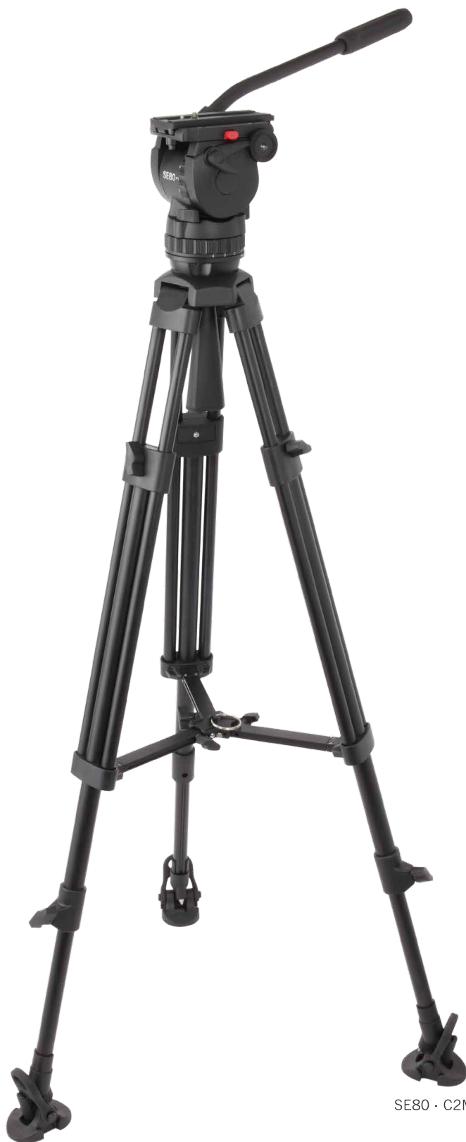
SE80 - C2M System

SE80 head + single fixed-length pan bar + 2-stage carbon tripod + mid-level spreader + soft carrying case.