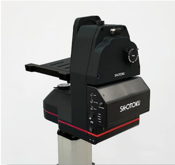
ANS - SmartPed with external third-party VR/AR tracking camera