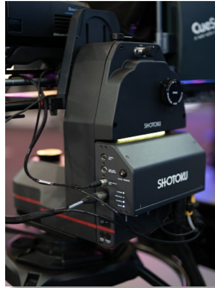
AN-I - Fully integrated navigation camera