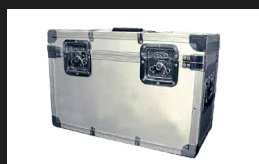
TS-25H TS-23H TS-12H

Center-opening semi-hard case with casters for TTH1502C or TTH1002C tripods with heads.